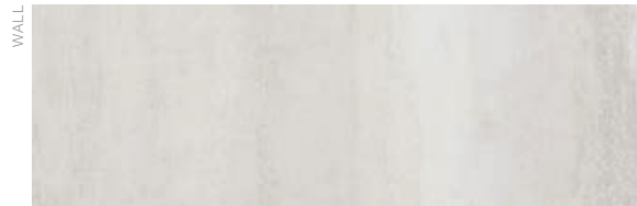
55075 Shanon White

The evolution of industrial style offered by the use of chemically processed metal sheets finds its greatest expression in the SHANON series, which combines style with being easy to fit and benefits in terms of the product's composition and maintenance, allowing spaces to be created in which it is part of both cladding and paving.