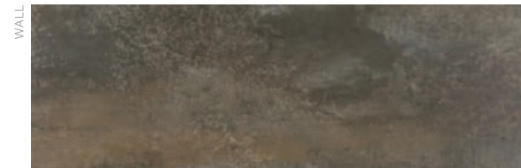
55044 Shanon Graphite